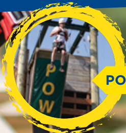
POWER FAN DESCENDER